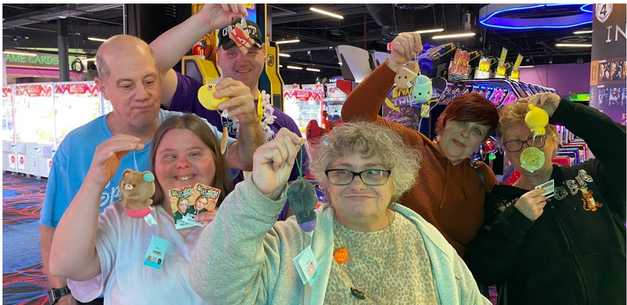
We won so many plushies!