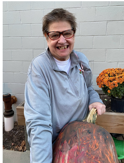
We brought them back, had some painting fun, and finished with a terrific taco dinner for Taco Tuesday!