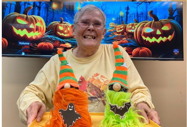
Look at all these homies making gnomies!