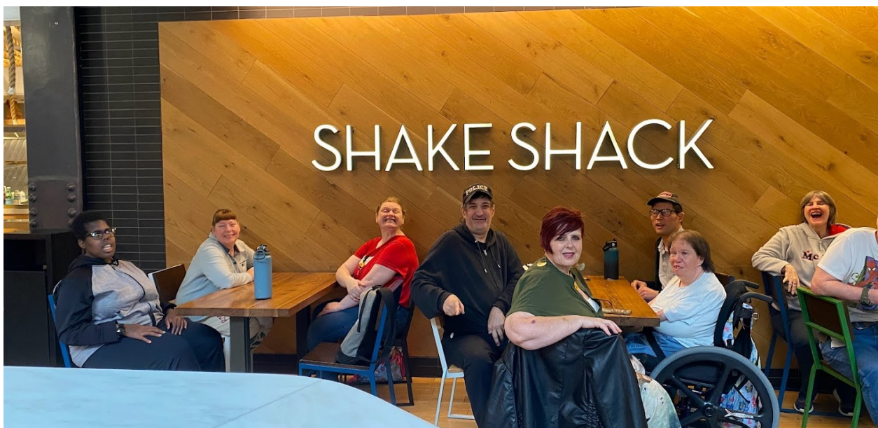
We explored the city, dined inside of Willis Tower, and had an amazing afternoon with friends!