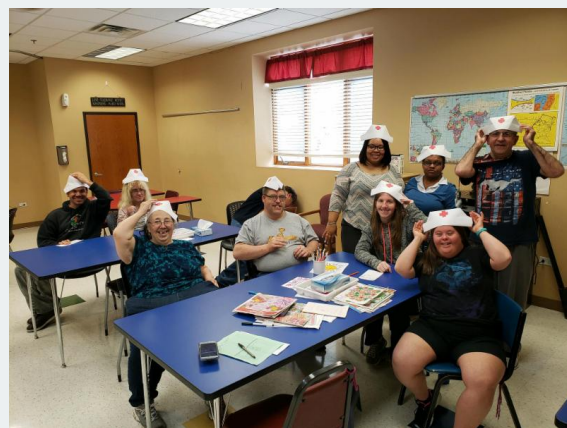
Paper nursing hats were made in honor of all nurses.